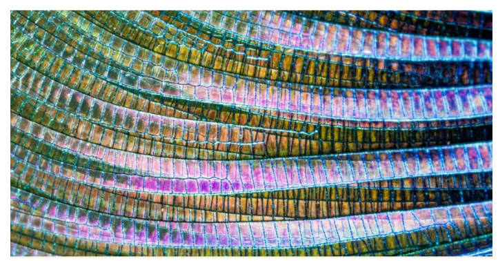
"The Rainbow Wing" - Commended (Small World)