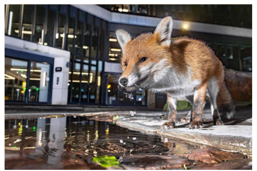
"Urban Fox Quenching It's Thirst from a Street Puddle" – Commended (City Life)